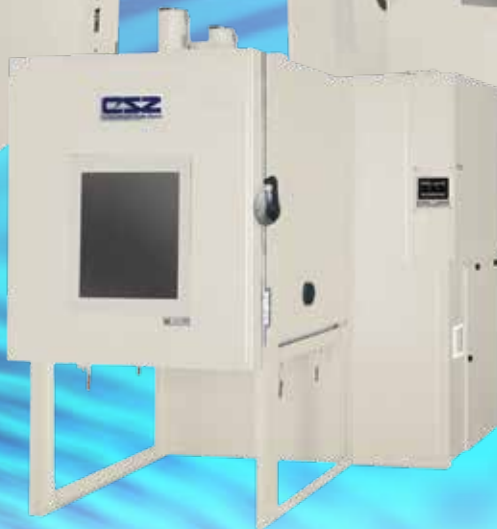
CV(H) Commercial Vibration