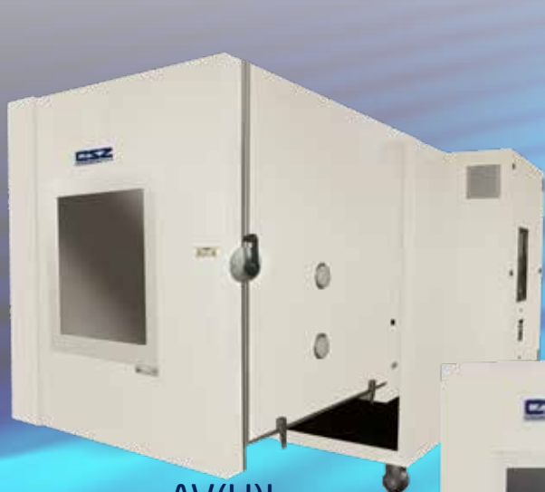
AV(H)L Cantilever Vertical Lift