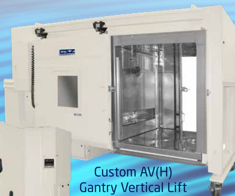
Custom AV(H) Gantry Vertical Lift