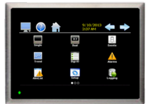
Icon - Based Navigation