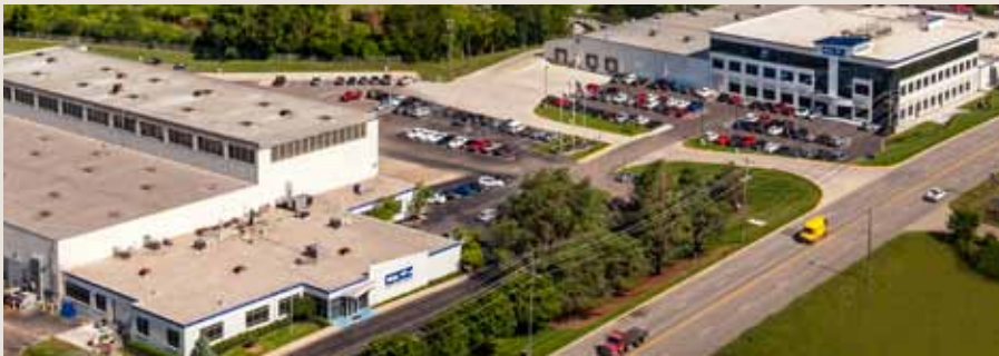
CSZ has two manufacturing facilities in Cincinnati, OH with world-wide sales and service.