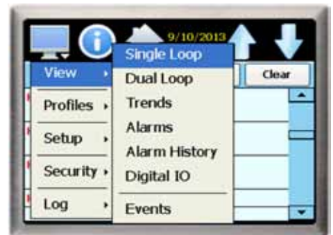
Windows - Based Navigation