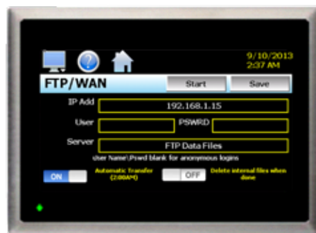
FTP Data Back Up