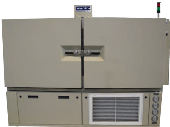
Front-opening freezer for epoxy storage

We also manufacture custom-designed freezers specifically for your product and application including custom sizes and temperature ranges.