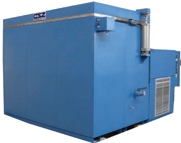
Custom size freezer with 168 cu. ft. interior