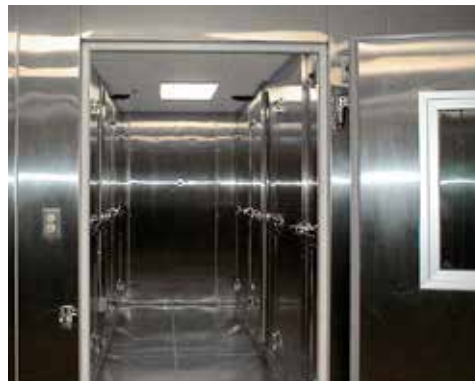
Typical hall access to multiple cold storage compartments - stainless exterior