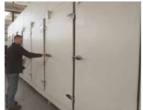
Freezer compartments with white painted exterior.