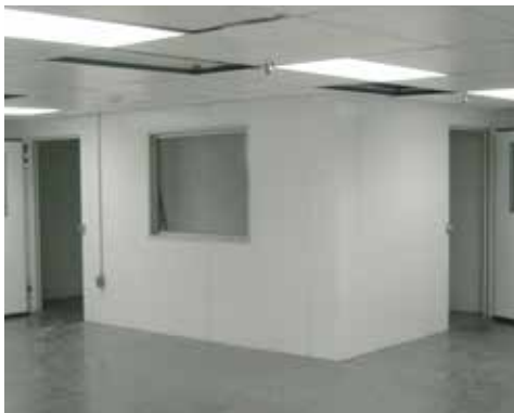
4 Ante Room provides additional environmental isolation for frequent entry

Save valuable time with the ease of use of the EZT-570 featuring fewer steps to accomplish your daily testing needs while incorporating simplified operation and programming to test faster.