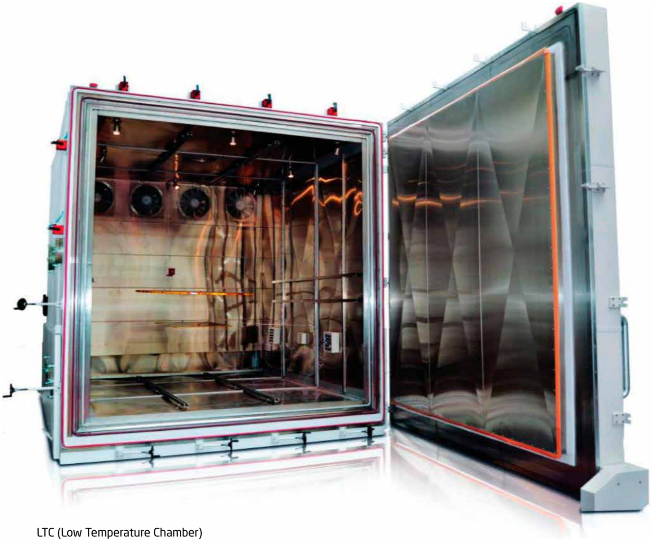
LTC (Low Temperature Chamber)

Customized altitude chambers may be designed to meet the test requirements for RTCA DO-160E rapid decompression.