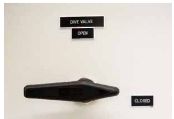
Dive valve rapidly decreases altitude