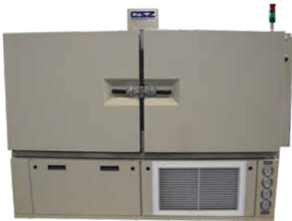
Front-opening freezer for epoxy storage

We also manufacture custom-designed freezers specifically for your product and application including custom sizes and temperature ranges.