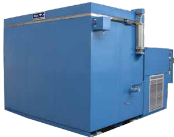
Custom size freezer with 168 cu. ft. interior